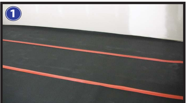
Unroll membrane and cut to fit. Flip membrane over, butt edges together and tape the seams.