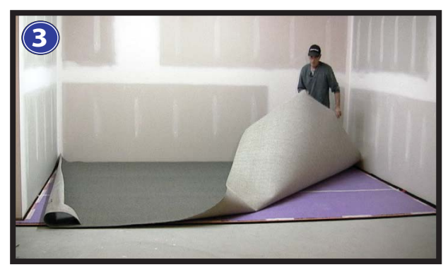
Install pad & carpet.

This brochure is only a guide and is not intended to be an installation instruction. For detailed instructions refer to roll label or go to www.superseal.ca