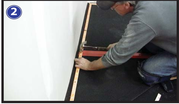
Nail tack strip through the membrane.